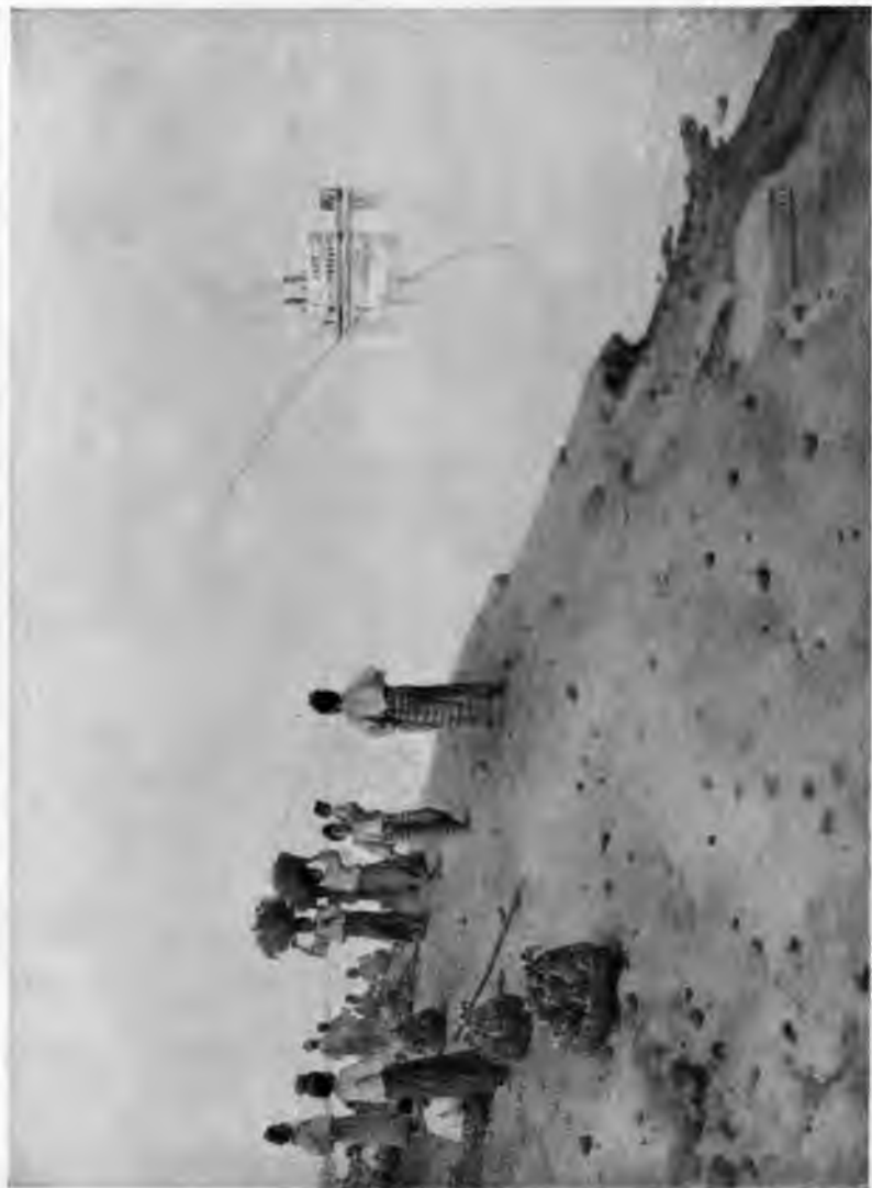
THE IRRAWADDY, Chapters II and I.